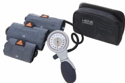
ANAEROID SPHYGMOMANOMETER WITH CHILD, ADULT AND SMALL ADULT CUFFS