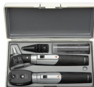
MINI 3000 Ophthalmoscope + MINI 3000 F.O. Otoscope With LED