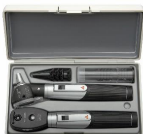
MINI 3000 Ophthalmoscope + MINI 3000 F.O. Otoscope With Halogen Bulb