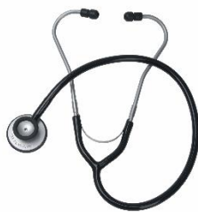
Acoustic STETHOSCOPE ADULT